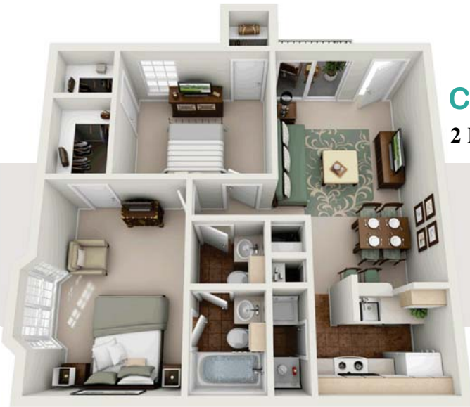
2 Bed / 1.5 Bath 826-838 Sq. Ft.*