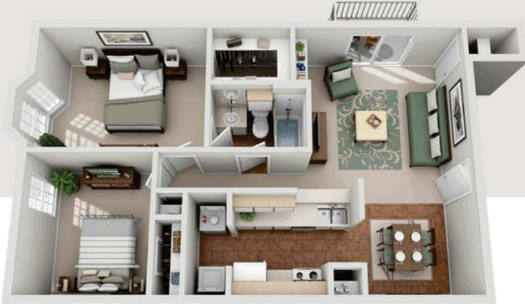
Abby 2 Bed / 1 Bath 765-801 Sq. Ft.*