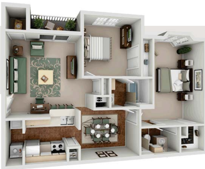
2 Bed / 2 Bath 900 Sq. Ft.*

*Square footage is approximate. Actual floor plans may vary.