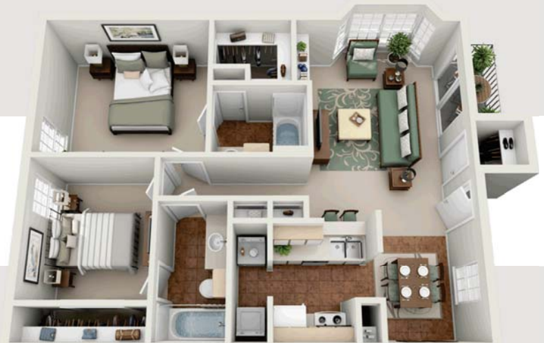
Dena 2 Bed / 2 Bath 873.5-885.5 Sq. Ft.*